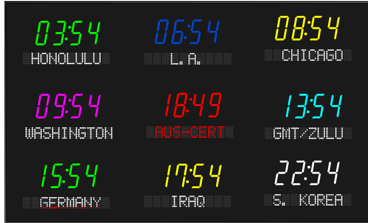
Model 6612P - 4.0" time, 2.0" zone labels, 9 zones